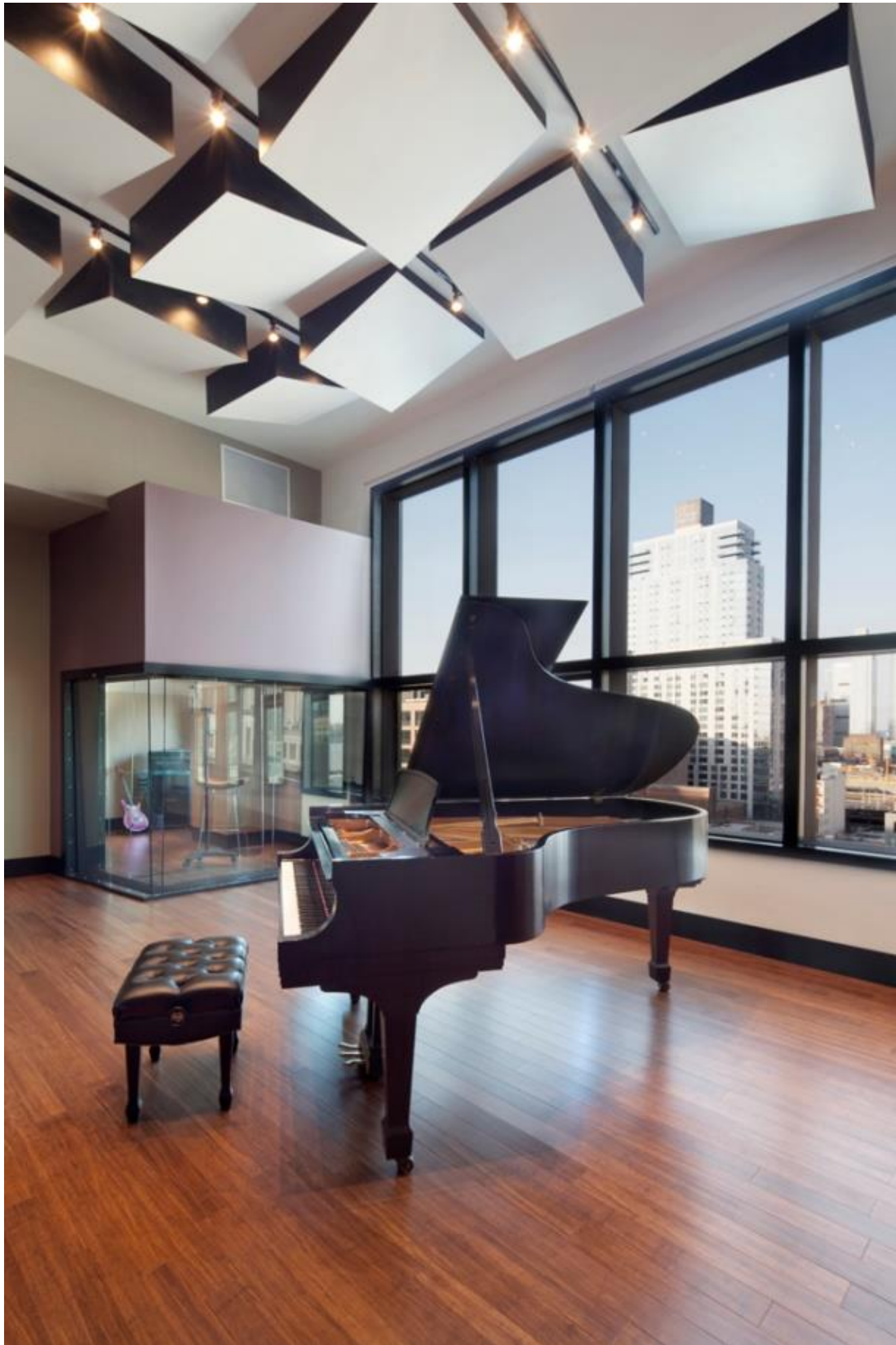
Jungle City Studios, New York, NY